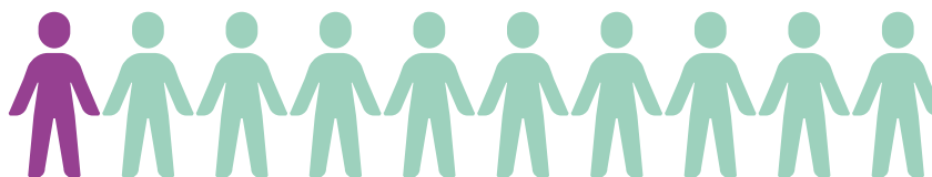
Only 7% of students of students having experienced gender-based violence in the context of their institution have reported it

What is alarming is that only 7% of students and 23% of staff who participated in the UniSAFE survey and stated that they had experienced gender-based violence within their institution reported the incident.