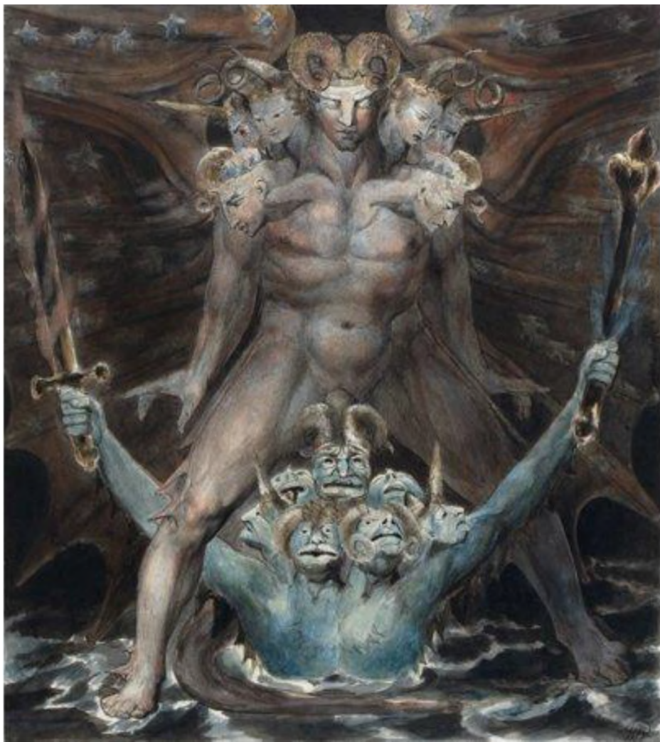
The Great Red Dragon and the Beast from the Sea