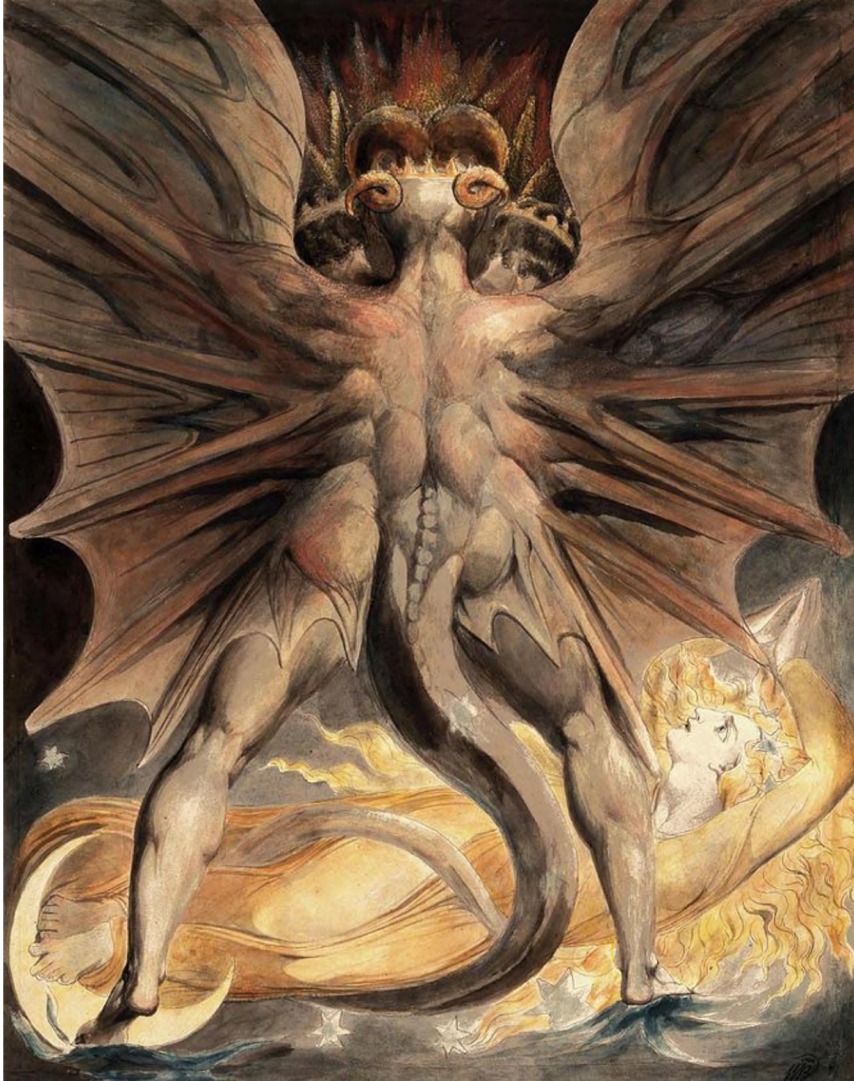
The Great Red Dragon and the Woman Clothed with Sun