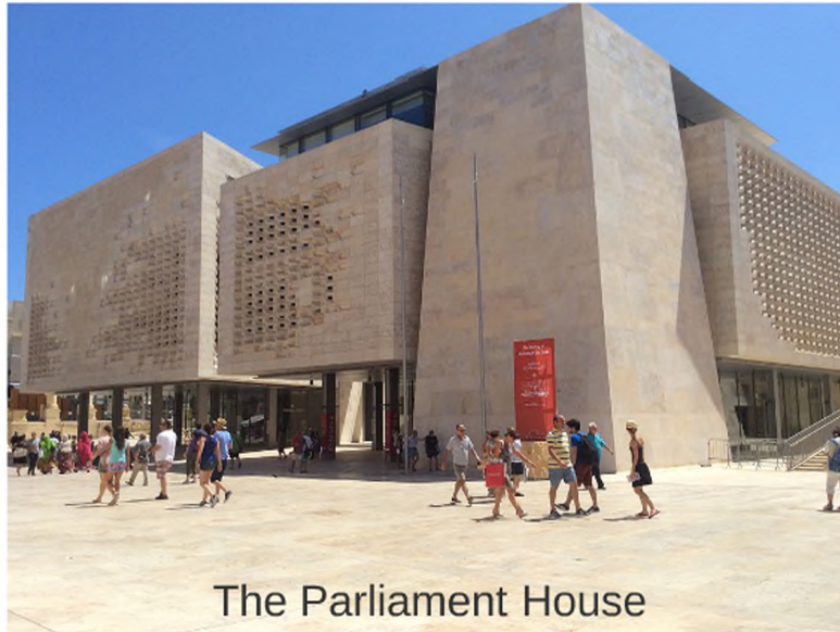
The Parliament House